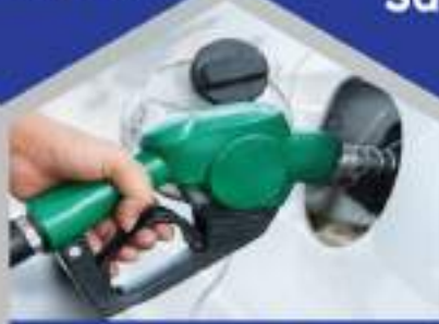
Energy & Power Sector