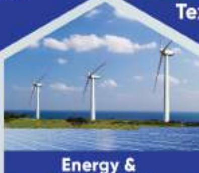
Energy & Power Sector